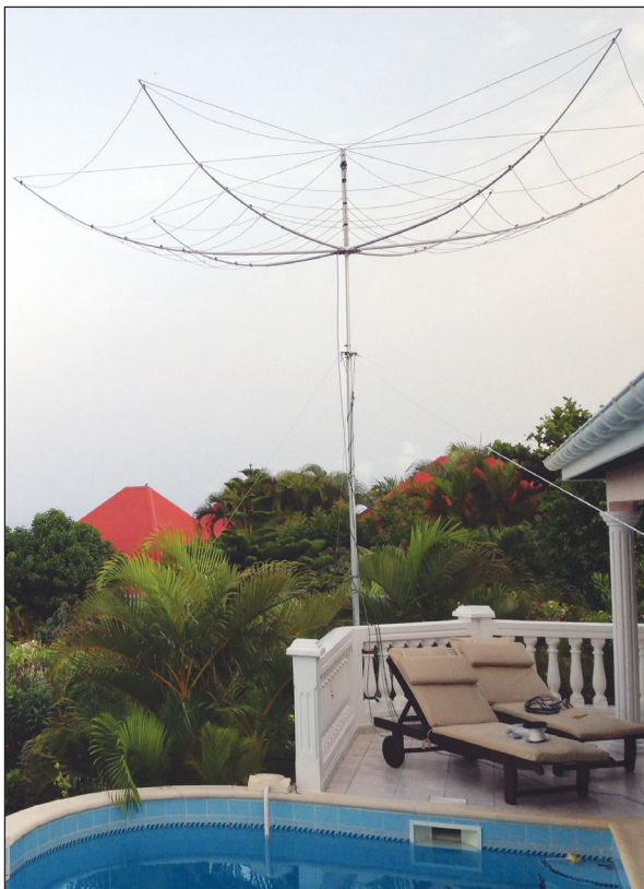
The Martins' beam by the pool at the villa.

The next day we went to work putting together other antennas — a 2 element 17 meter vertical array, an 80/40/30 meter vertical dipole, and a 30 meter inverted V. We had the pleasure of meeting Adolphe Brin, FJ5AB, who came by our villa to visit. Over the course of