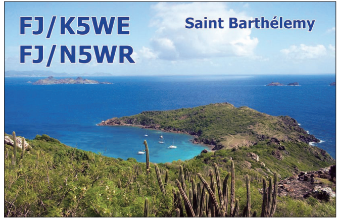
The father/son QSL card confirming St Barts.

our stay we settled into an operating routine, with Dad generally operating in the morning, me later in the afternoon, and both of us in the evening. Using band-pass filters allowed us to operate at the same time without much interference.