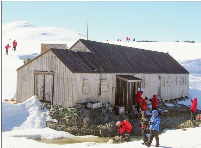
Figure 5 — The former British Antarctic Survey station on Detaille Island.

to safely kayaking, to great meals, was smartly handled by the superb crew.