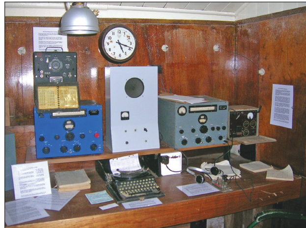
Figure 6 — The radio room at the Port Lockroy station.

The return trip across the Drake was also relatively calm, but we were sailing at fairly high speed, so the wind prevented extending the antennas. On the last night I was able to operate until rather late. When the time came to pack up, I didn’t want to