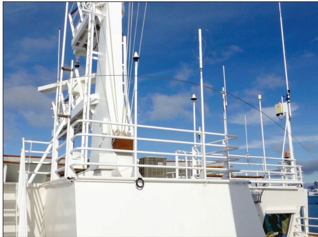
Figure 2 — The dipole set up for 20 meters, among the other antennas above the bridge.