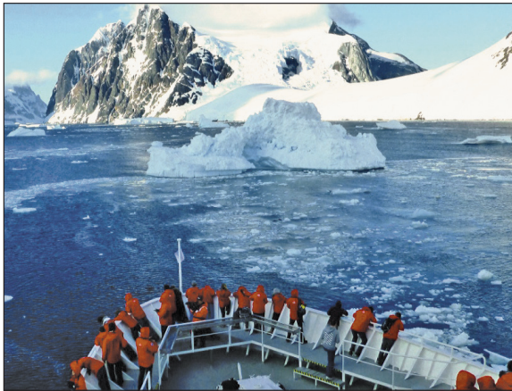
Figure 3 — Icebergs and mountains as seen from the Lemaire Channel.

and Spanish identifying it as Amateur Radio equipment, along with a copy of my license.